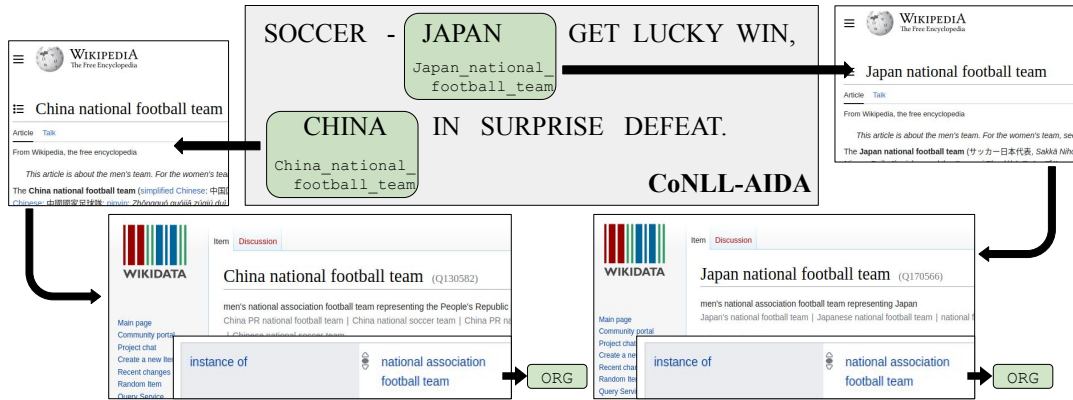
Figure 2: A good portion of named entities in CoNLL-03 have manually assigned Wikipedia URLs in AIDA. In the example sentence "JAPAN" and "CHINA" are linked to the article of the referred sports teams from which we derive their Wikidata items and categories.

as the coverage of entity annotations. We found that of all 34,941 entities in the Reiss CoNLL version, 78.9% have an entity link in AIDA, while the remaining 21.1% (7,369 entities) do not. We found three main reasons for lack of coverage: (1) Rare entities that at time of labeling had no corresponding Wikipedia article are unlabeled in AIDA. (2) The definition of what constitutes a named entity differs in some instances, with CoNLL-03 for instance labeling the span "Boeing 707" as entity, while AIDA links only "Boeing". (3) Some common entities like "EU" for unclear reasons are consistently unlabeled in AIDA.