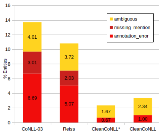
Figure 4: Estimation of annotation quality based on a manually evaluated sample of 100 sentences for each of the four CoNLL-03 variants. For visual clarity we exclude the correct spans. We find that CLEANCONLL has a significantly lower share of annotation errors than prior versions.

We conduct a more extensive qualitative discussion of labeling decisions in CLEANCONLL, and how they differ from CoNLL-03, in Appendix A.5 and Table 7. There, we discuss examples that cover different types of annotation problems, like outright wrong labels, missing mentions, boundary problems as well as inconsistent use of labels on similar or even the same instances.